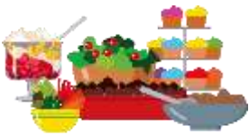
Music Volunteer Potluck